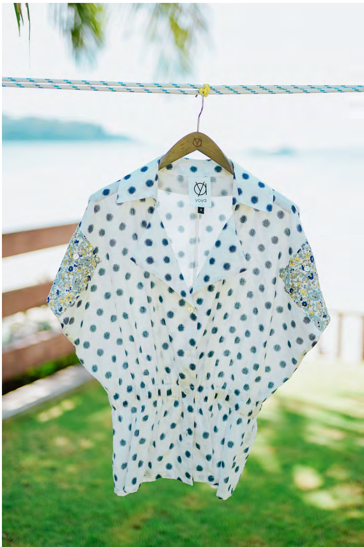
Cameron top 4595 Available in XS-L