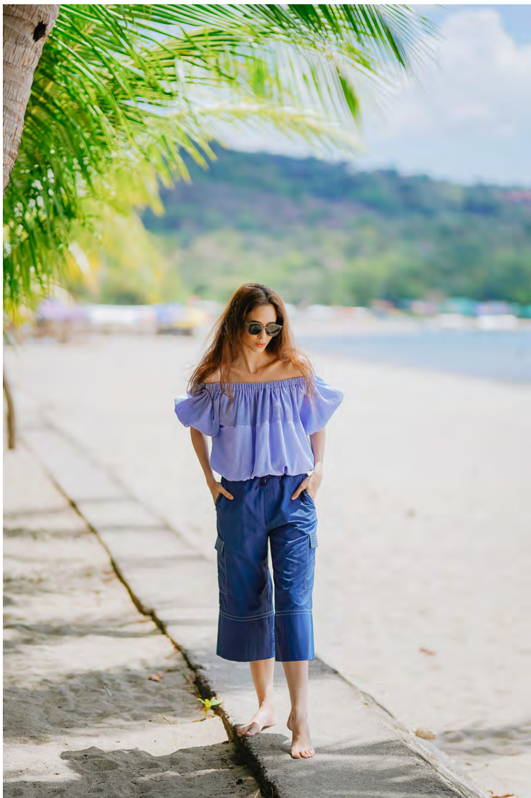
Lewis pants 6595 Available in XS-L