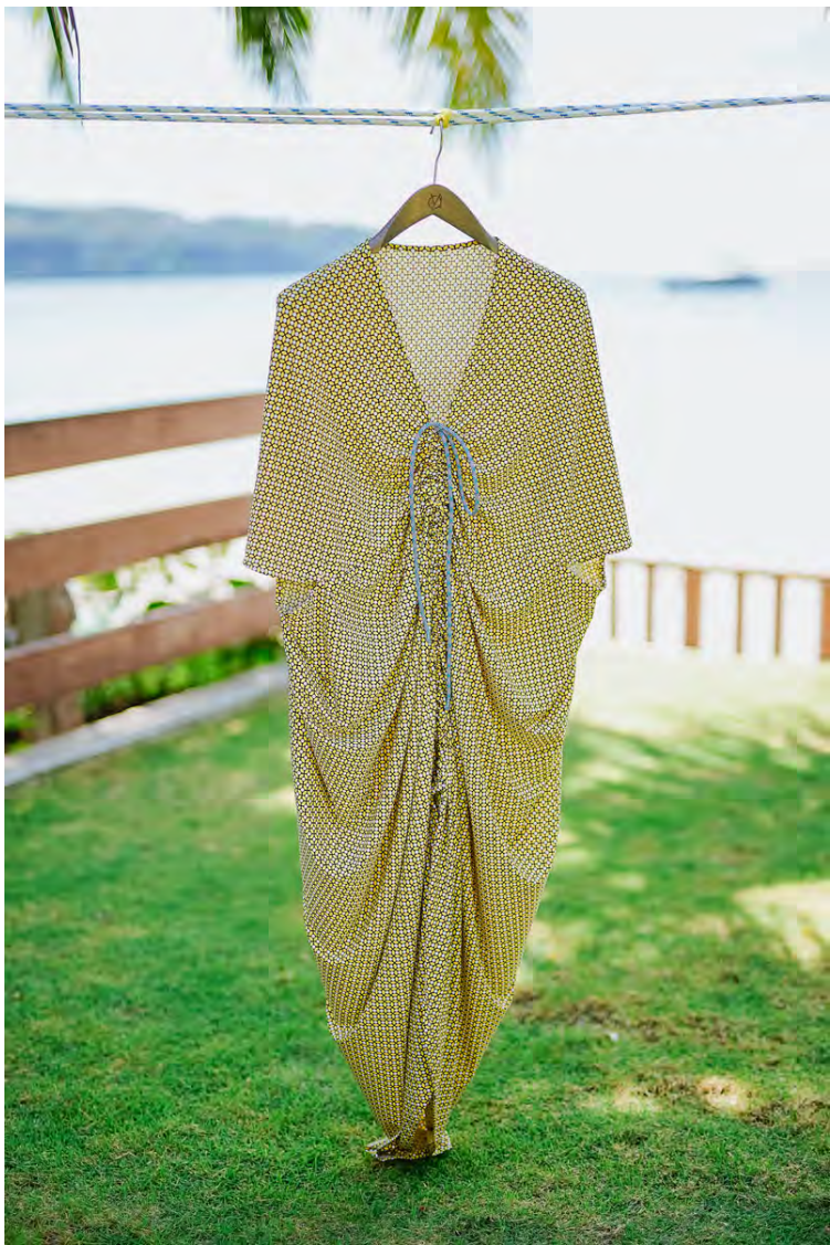
Avalon dress 5995 Available in S and L