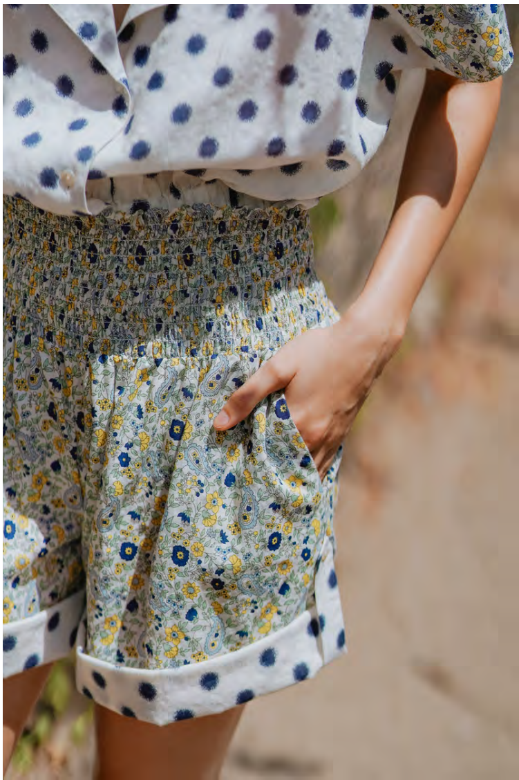
Courtney smocked shorts 4595 Available in S-M