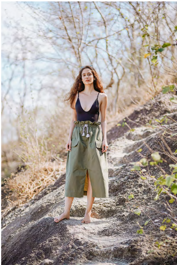
Albany skirt/dress 6595 Available in XS-L