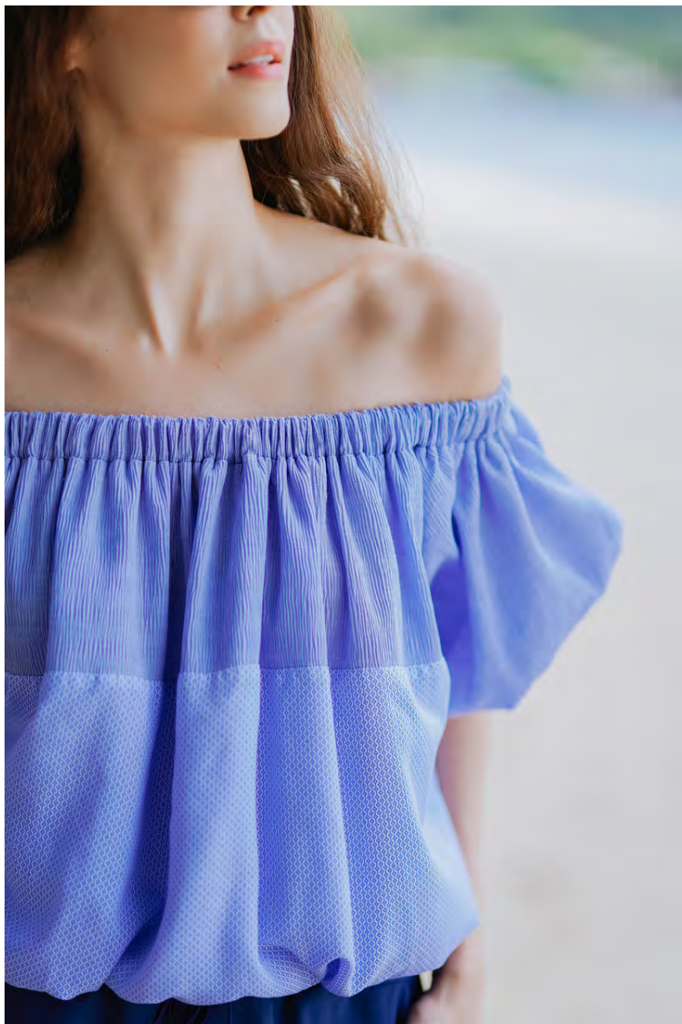
Beacon top 5595 Available in XS-L