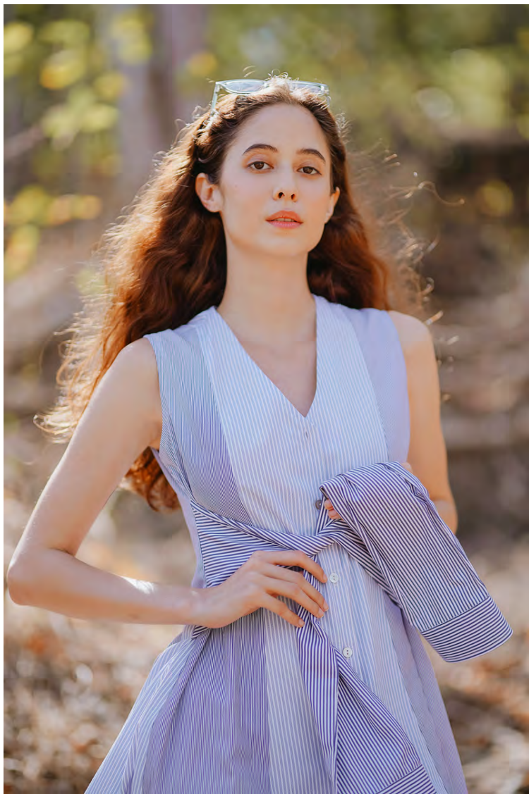
Tofino dress 8995 Available in XS-L