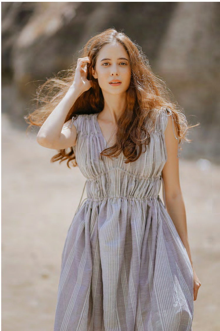
Hamley dress 8995 Available in one size (adjustable fits XS-L)