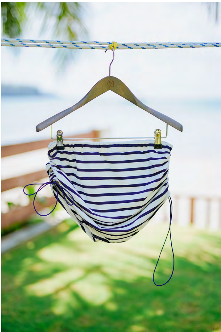
Cedar shorts 3295 Available in XS-M