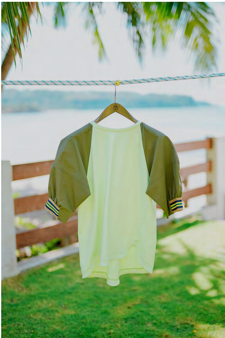
Luxton top 5595 Available in XS-L