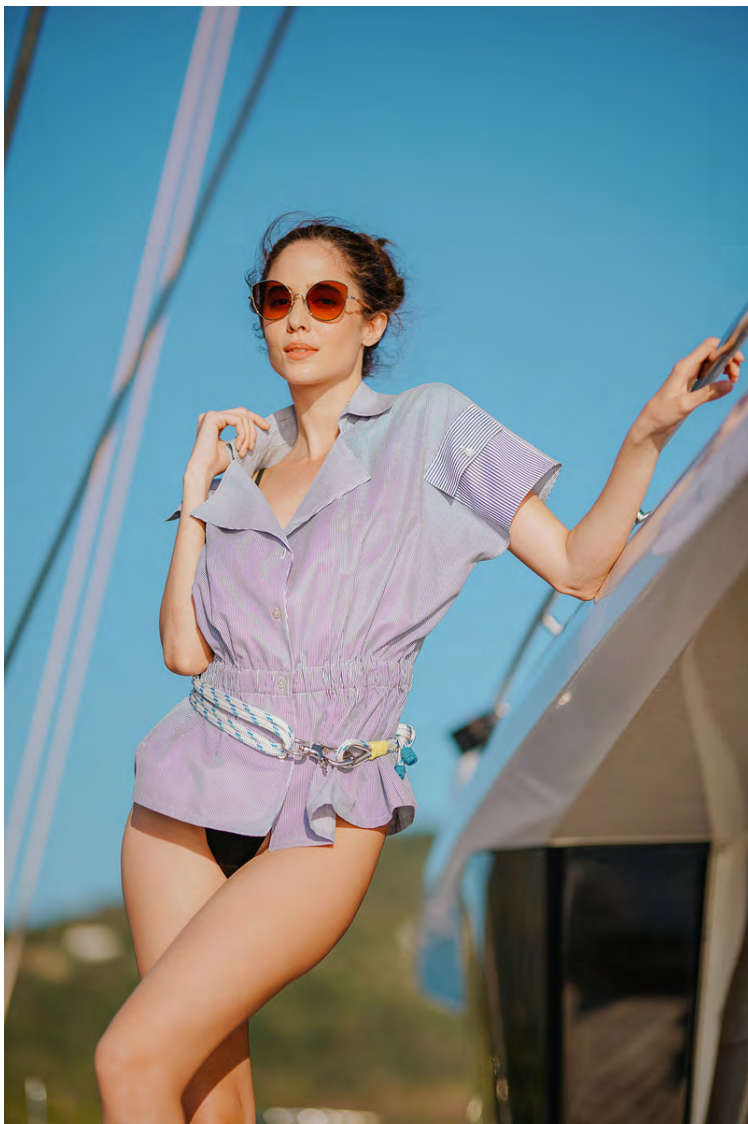
Cameron top 4595 Available in XS-L