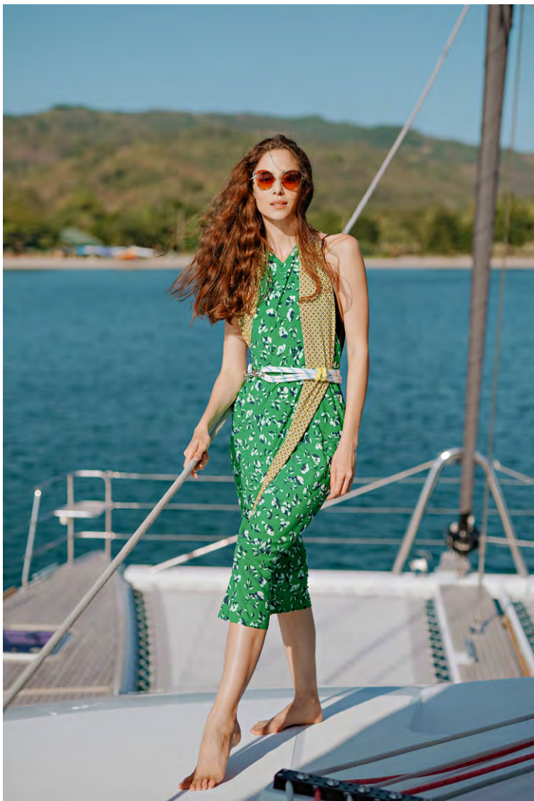
Ellice sarong dress 4995 Available in One Size (Fits XS-L)