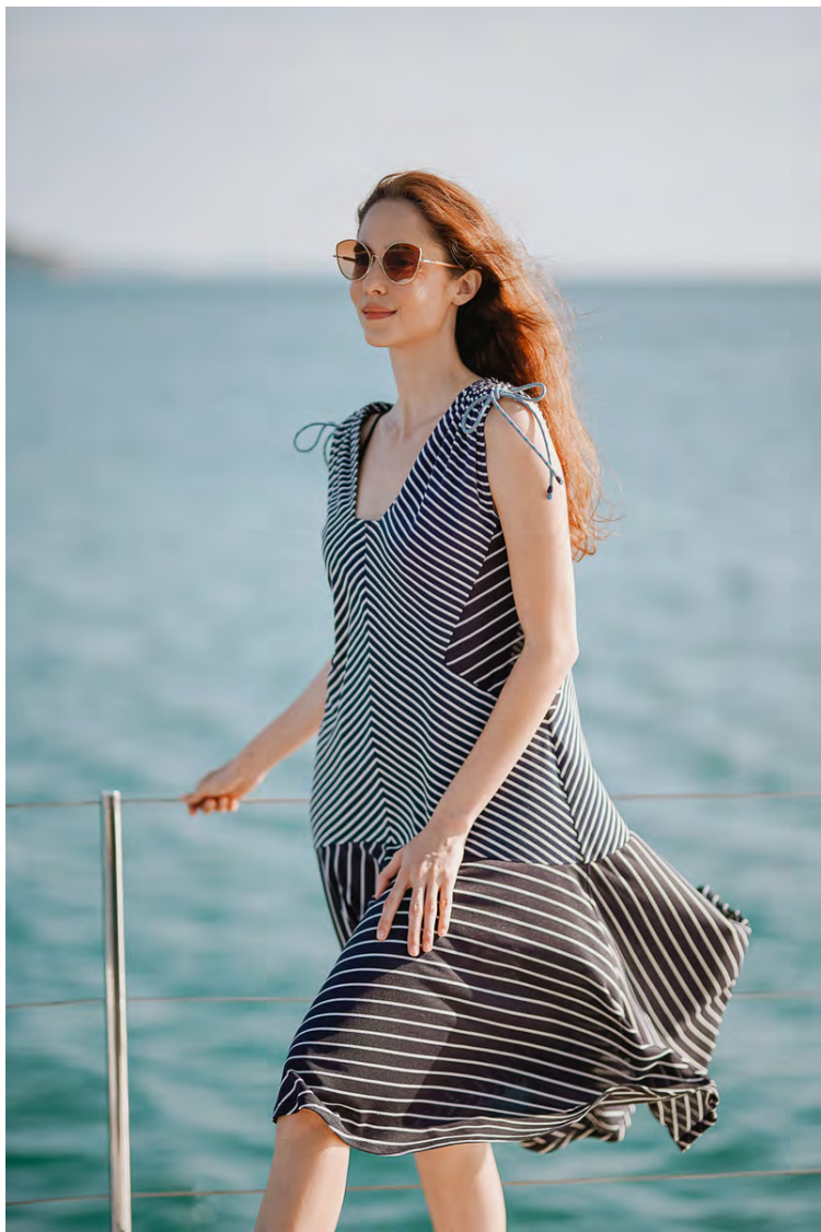
Lotus dress 8995 Available in XS-L