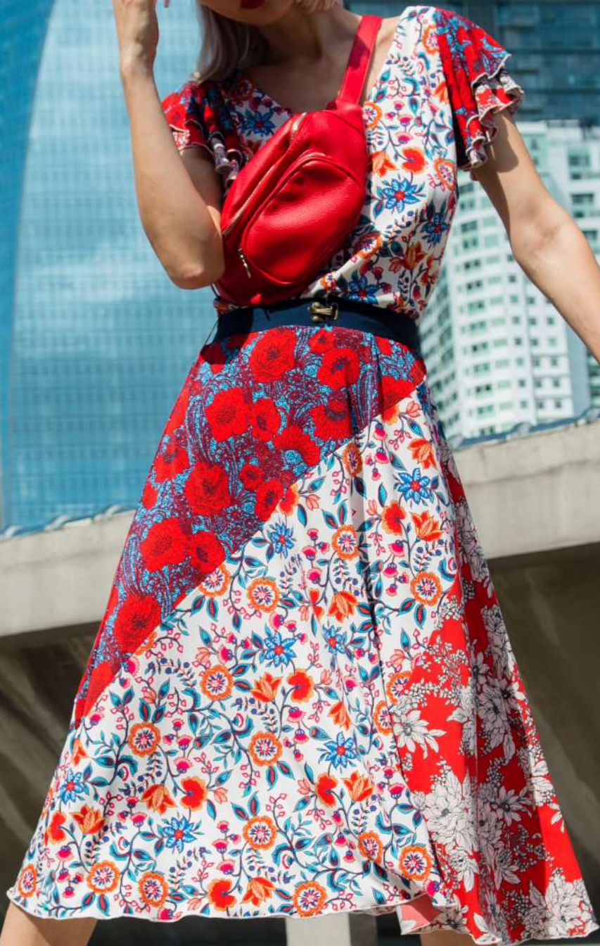
DRAYTON Dress USD 159 | PHP 7995