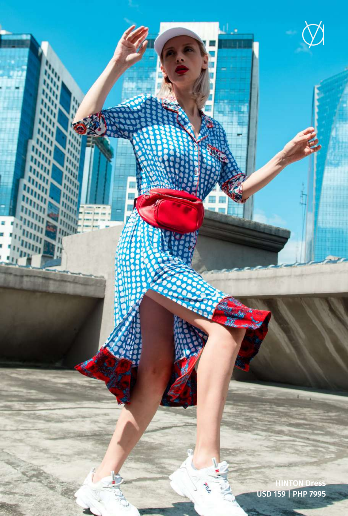
HINTON Dress USD 159 | PHP 7995